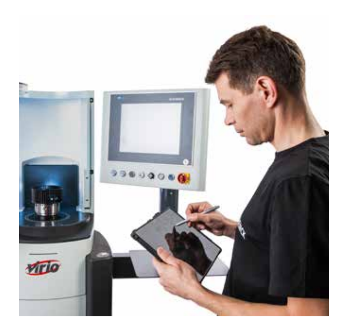
Top-class technology – easy handling and highest precision

Upload a changed set of rotor data from the server, look at the Q statistics on a smartphone or create new set-up data for the balancing machines in the comfort of the office. Or use our online service with remote maintenance and the extensive diagnostics tools – today everything is included naturally. This and much more is possible with our current measuring devices. Our CAB 820 and CAB 920 measuring devices offer you every possibility as standard to integrate them in a network and to communicate with them – exactly according to your wishes and ideas!